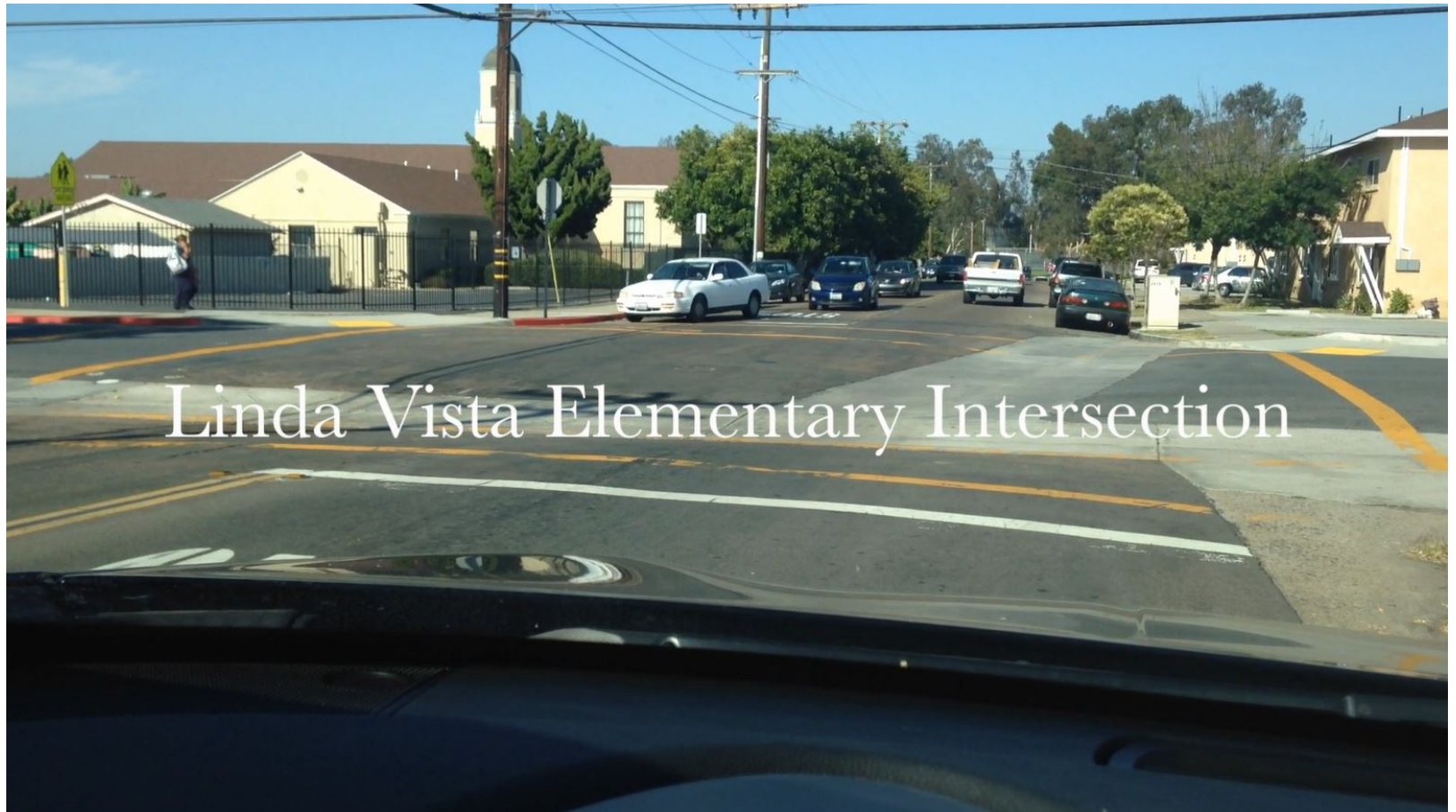
Linda Vista Elementary Intersection